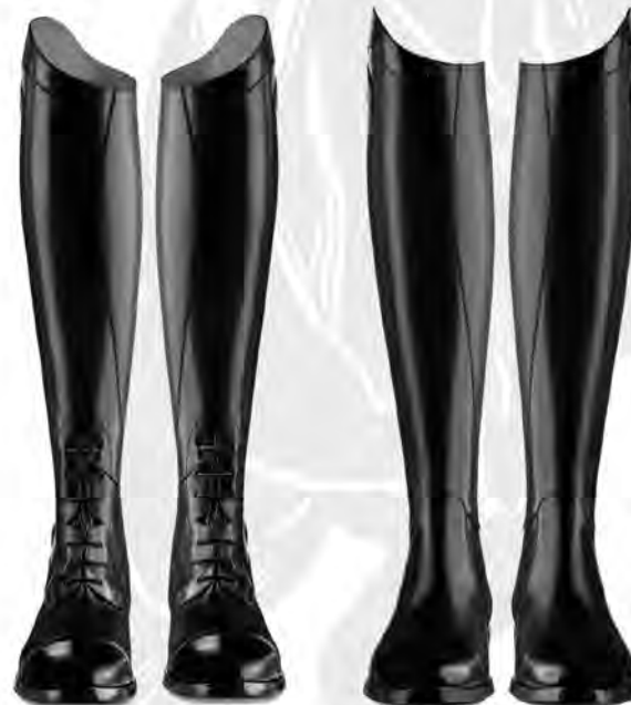
Orion Field Boots

Stop by & allow our fitting experts to properly size you, in a perfect new pair of EGO7 boots.