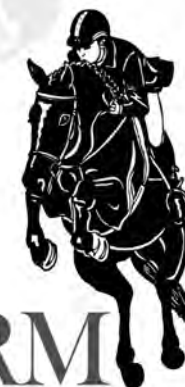
Aries Dress Boots